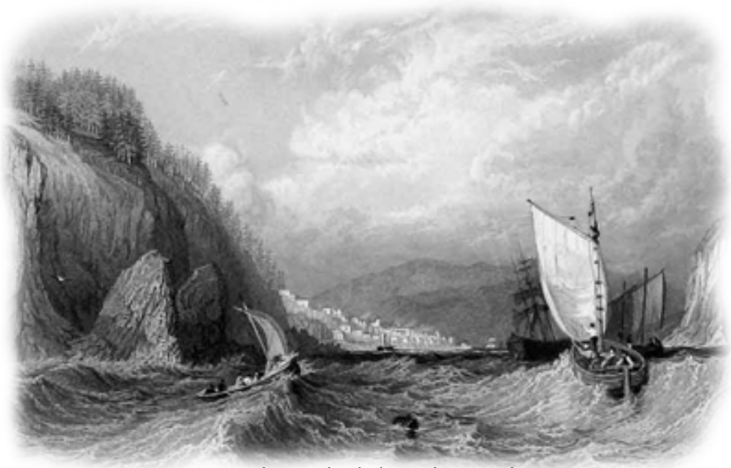
Narrow is the way that leads to the Eternal City